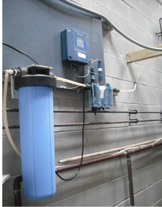
Figure 4: Chlorine and pH Monitoring System