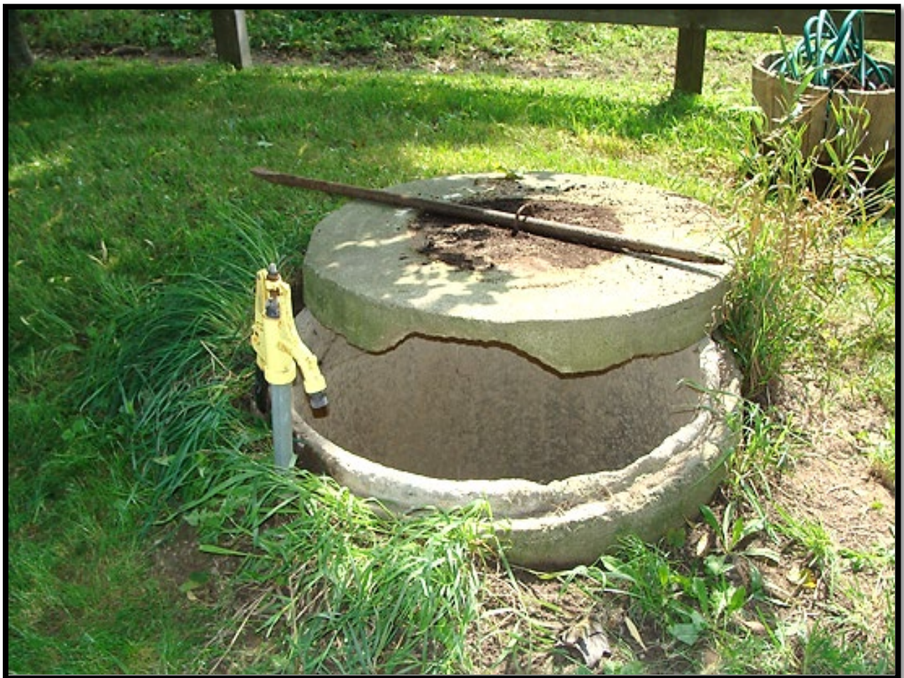
Figure 1: Damaged Lid and Casing

PHIs also monitor sampling compliance and results of tests on a regular basis. When adverse water quality incidents (AWQIs) are reported, PHIs follow-up with the owner/operator, provide directions as necessary, and ensure corrective actions are taken. In addition, the Health Unit discloses the results of the risk assessments, the risk level, and any adverse events for SDWS.