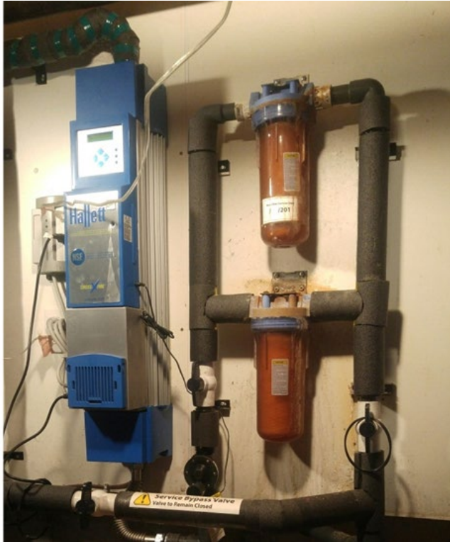
Figure 2: Ultraviolet Light System

Ultraviolet treatment systems use ultraviolet light to inactivate or kill bacteria, viruses and cysts in contaminated water. The UV system is also required to have an alarm or an automatic shut-off. The purpose of the alarm is to notify the operator there is an issue with the treatment device and an automatic shutoff will stop directing water to the users if the UV system fails to treat the water.