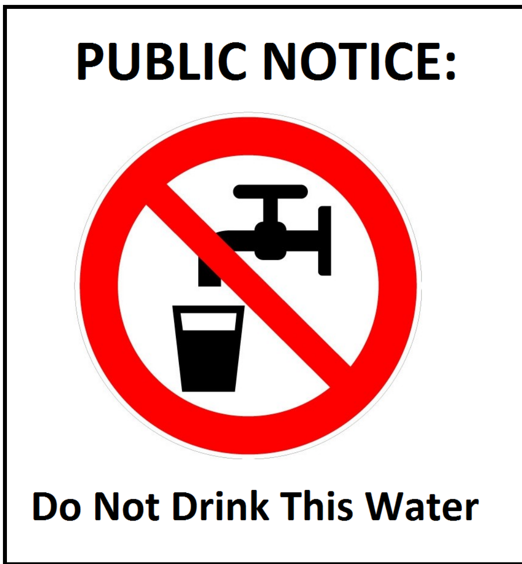
Figure 6: Example of Signage for a Posted System

The directive issued by a PHI may require an owner/operator to post and maintain warning signs notifying users not to consume water from the SDWS. Routine checks of signage at all entrances and access points to water are required. This is to confirm signs are posted, in a good state of repair and are easily readable. Even if a system is posted, operators should still be checking the well and other components of the system to prevent contamination of the source water. The frequency of routine checks is determined by your PHI who takes into consideration the type of facility and usage.