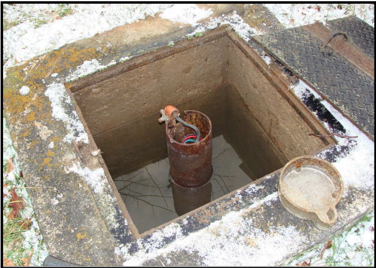
Figure 5: Potential Surface Water Contamination