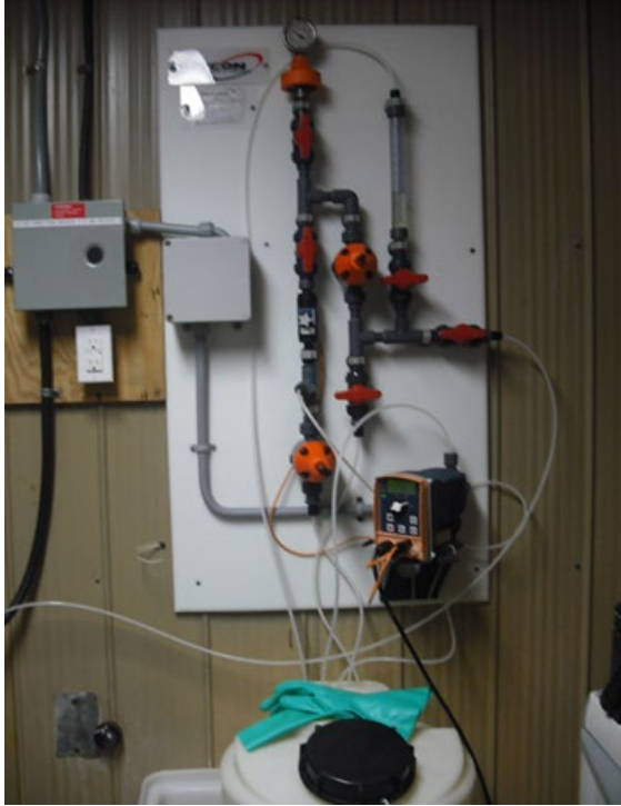
Figure 3: Chlorine Injector